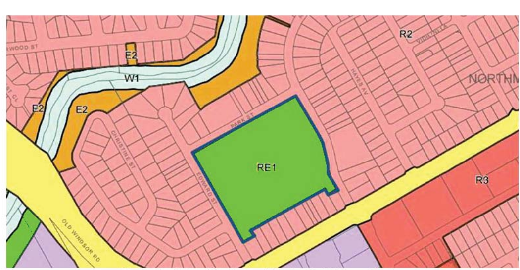
Figure 3 - Site of Northmead Redbank Childcare Centre

Northmead Redbank Childcare Centre, Arthur Phillip Park, Redbank Road, Northmead (see Figure 3) Lot 53 DP128577