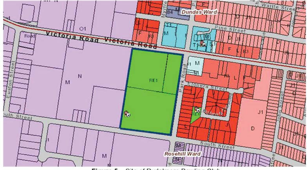
Figure 5 - Site of Rydalmere Bowling Club