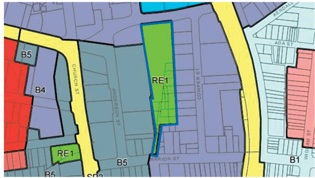
Figure 1 - Site of Jubilee Park Child Care Centre